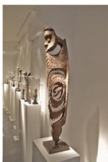
A 19th-century wooden Ewa figure from the Korowori River, Papua New Guinea. Arte y Ritual

The chance of making contact with a billionaire impulse buyer continues to lure dealers to exhibit at the Biennale. Now in its 27th edition, the alternate-year event, which has taken place in the spectacular Grand Palais since 2006, is the oldest and grandest of the traditional art and antiques fairs. It’s also the most expensive for exhibitors, with a relatively small booth costing a basic €65,000. For all the magnificence of the setting — and the Jacques Grange-designed booths inspired by the gardens of Versailles — it remains a relatively small, dealer-organized fair with 89 participants, mostly French. In contrast, this year’s Tefaf Maastricht featured 274 exhibitors. Unlike its Dutch rival, the Biennale doesn’t have the critical masses of dealers in dedicated collecting areas that attract specialist international buyers.