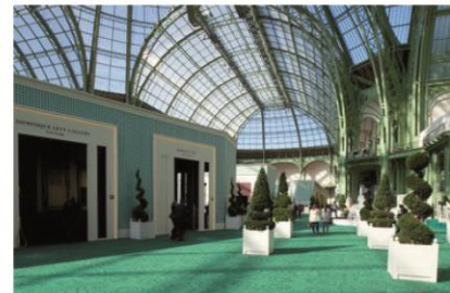
The 2014 Biennale des Antiquaires at the Grand Palais in Paris. Julio Piatti

The gallery-lined rue des Beaux-Arts and the rue de Seine were bustling with international collectors, many American, at the opening of Parcours last Tuesday. There were several stand-out shows. The up-and-coming